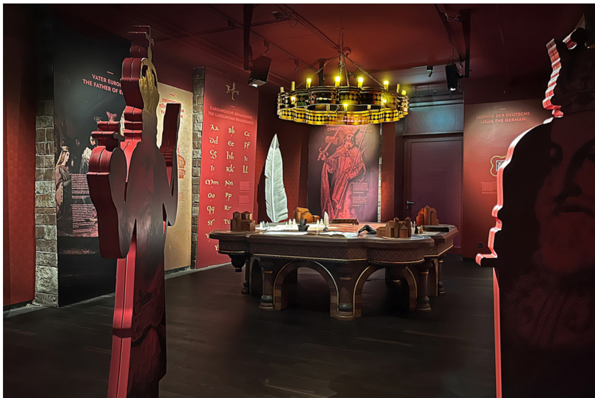
Deutschlandmuseum | ©Deutschlandmuseum